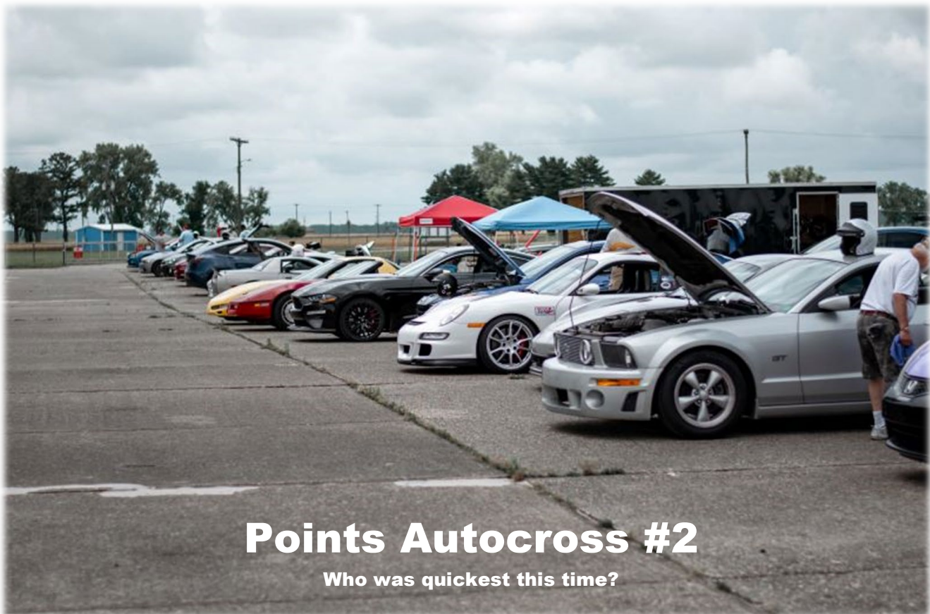
Points Autocross #2 Who was quickest this time?