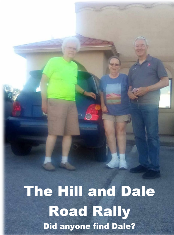
The Hill and Dale Road Rally Did anyone find Dale?

SCCA Southern Indiana Region Monthly Newsletter July 2024 Volume 71 Number 7